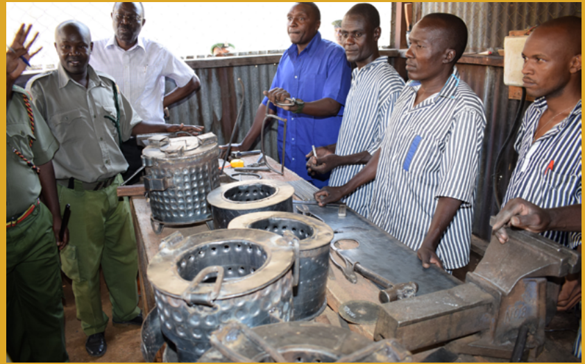
Inmates exhibiting products made at the metalwork section in prison.

All pardoned ex-offenders released by the President had trained in the various craft courses offered by the Kenya Prisons Service such as; Carpentry and joinery, Upholstery, Masonry, Tailoring and dress making, panel beating and spray painting, welding among others.