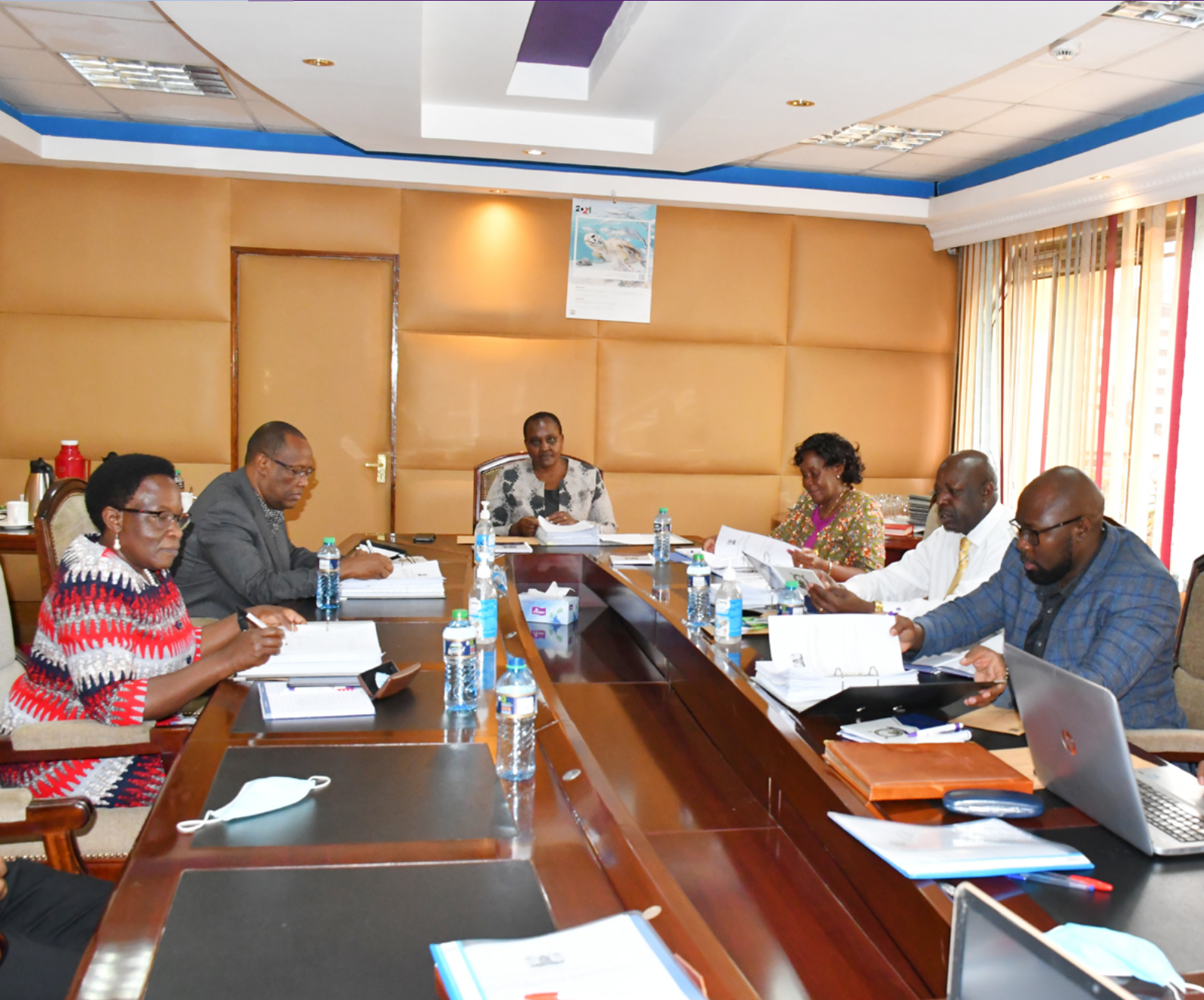
The Power of Mercy Advisory Committee during a paper-hearing session of petitions at the secretariat boardroom.

ISSUE 2, MARCH 2022 ; BIANNUAL PUBLICATION