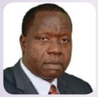
Dr. Fred Matiang'i, EGH MEMBER