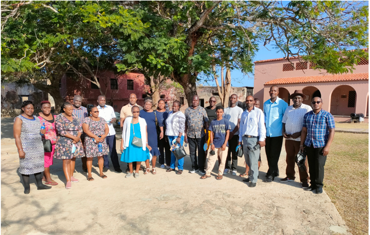
Power of Mercy Secretariat at Fort Jesus, Mombasa.