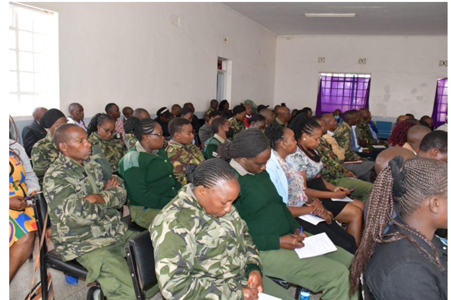
A multisectoral Stakeholder sensitization forum, Machakos County.