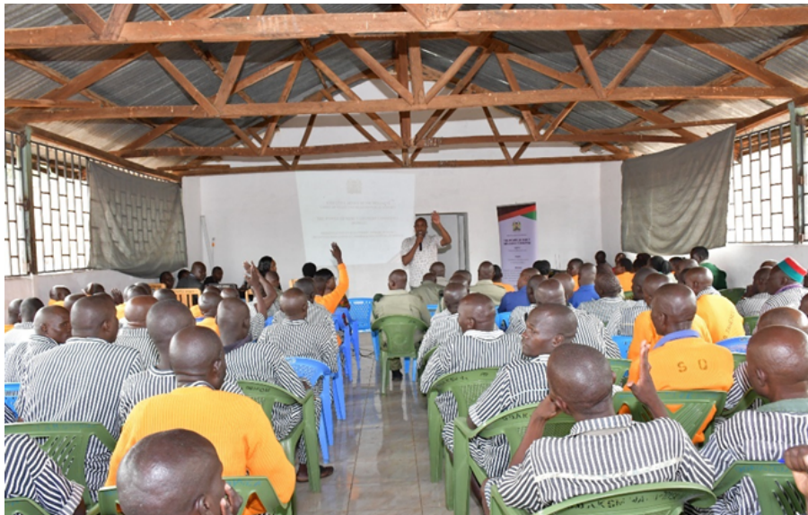
Sensitization exercise at Kodiaga Maximum Security Prison in Kisumu County.