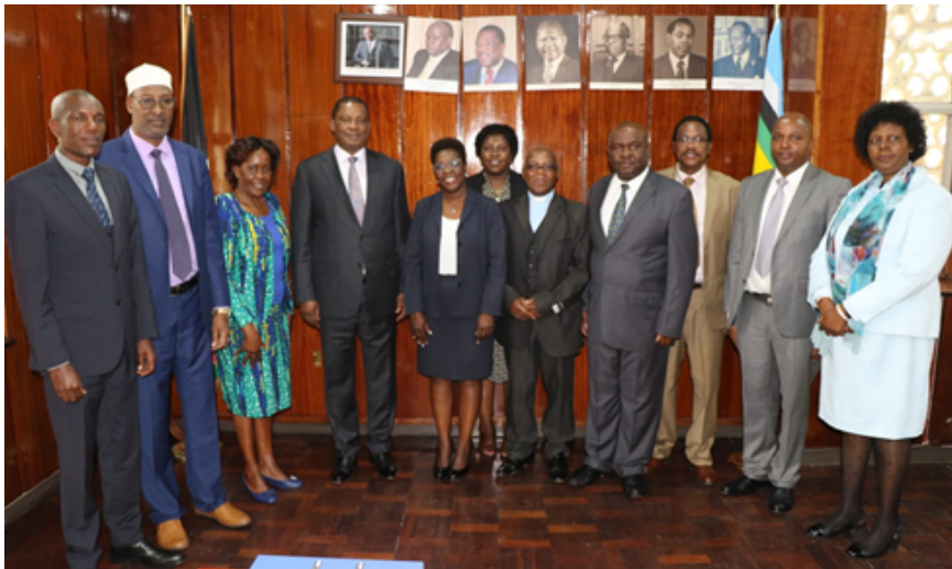
The Power of Mercy Advisory Committee members posing for a photo with their Chair, the Hon. Attorney General Mr. J.B.N. Muturi after holding the first Committee meeting.