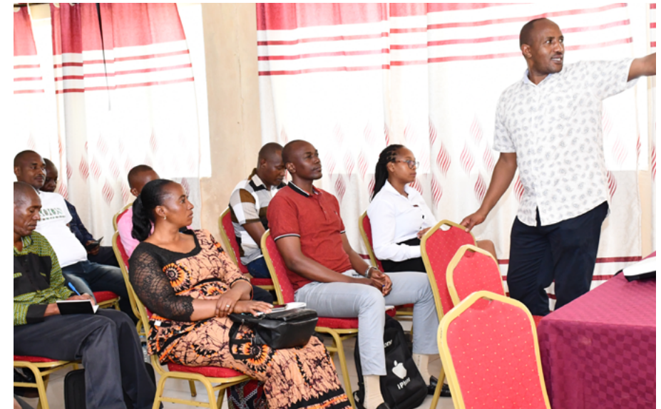
Training session to the Mombasa County team at the County Commissioner's Hall.