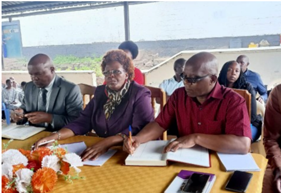
Committee members during ePOMPMIS sensitization in a Prison.