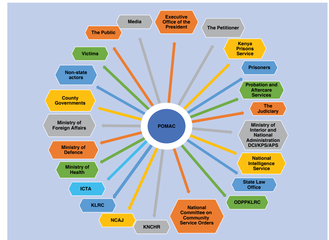
Fig 1: POMAC key stakeholders

with the Committee include: Kenya Prisons Service, Probation & After Care Service, National Police Service, National Intelligence Service, National Government Administration Officer and the Information, Communication & Technology Authority.