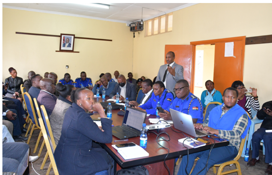
Stakeholders in the Criminal Justice System drawn from the South Rift region, during a training and sensitization forum held at the Nakuru County Commissioner's Hall.